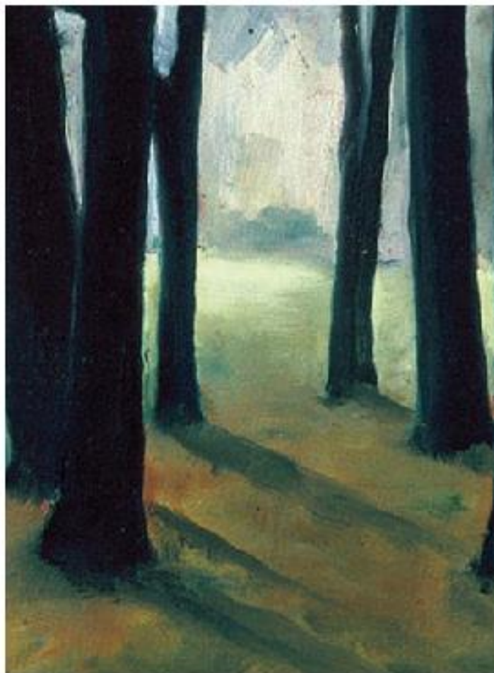
Tree Circle (1892), Peter Schrod. Oil on paper, 7 1/2" x 8 1/2". © Peter Schrod.

His hands were tight closed as if his nerve were something tangible that someone in the darkness was trying to tear from his grip. The softness of the